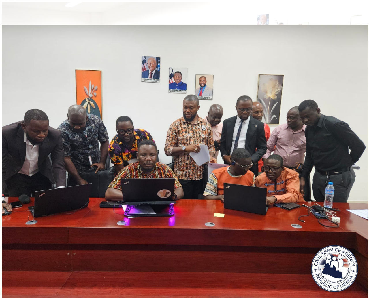
Some members of management team at the planning retreat

performance metrics for each strategic objective, establish baseline data, and facilitate continuous learning through mid-term and final evaluations. The insights generated from the MEL process will guide decision-making, inform necessary course corrections, and ensure CSA remains adaptive to evolving governance needs. Through this comprehensive approach, CSA will ensure efficient execution, accountability, and continuous improvement, reinforcing its role in driving public sector transformation and national development in Liberia.